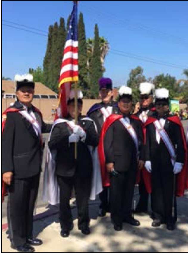
WELL-DRESSED – The Council's Fourth Degree team marched in the July 4 parade in Lake Forest.